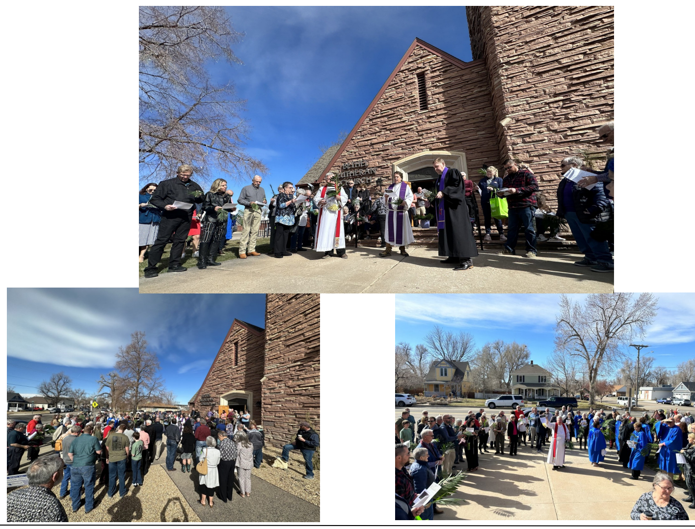
St. Alban's Episcopal Church