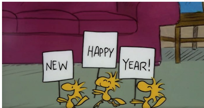
From Charles M. Schulz Museum and Research Center, Santa Rosa, California.

Beloved, God loves us. Therefore, let us live this new year in the newness and fullness of God's love for us. If we do we can be assured that no matter what the universe throws at us – the bad, the good, and all that is between – God will be present with us – loving us. This is why, however unrealistic it may be, it is my hope for you, that your 2024 brings you a new, happy, year!